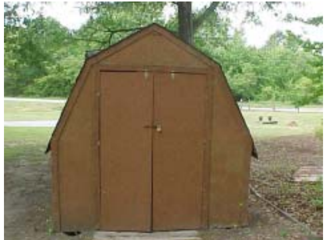
Rebuilt shed doors