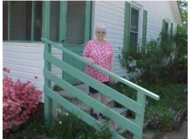
Put Up Hand Rail