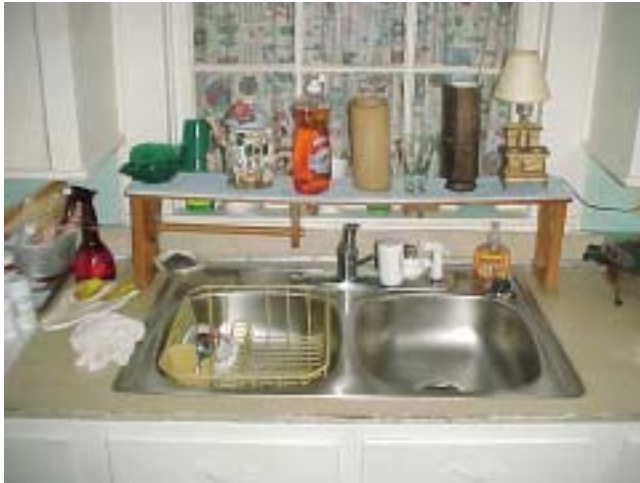
Replaced A Kitchen Sink And Installed Faucet