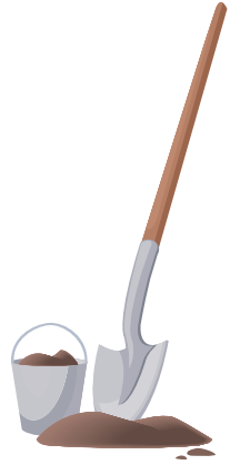
Local summer camp 2001