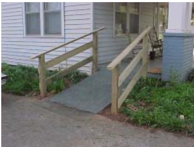
Put Up Hand Rails