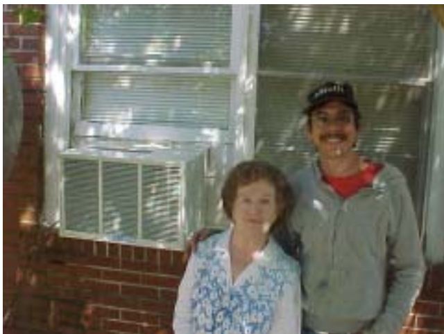
Repaired Window & Installed A/C