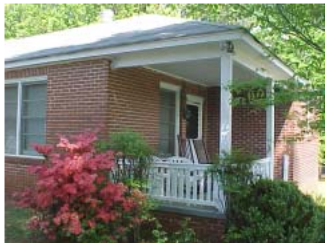
Painted Trim And Porch